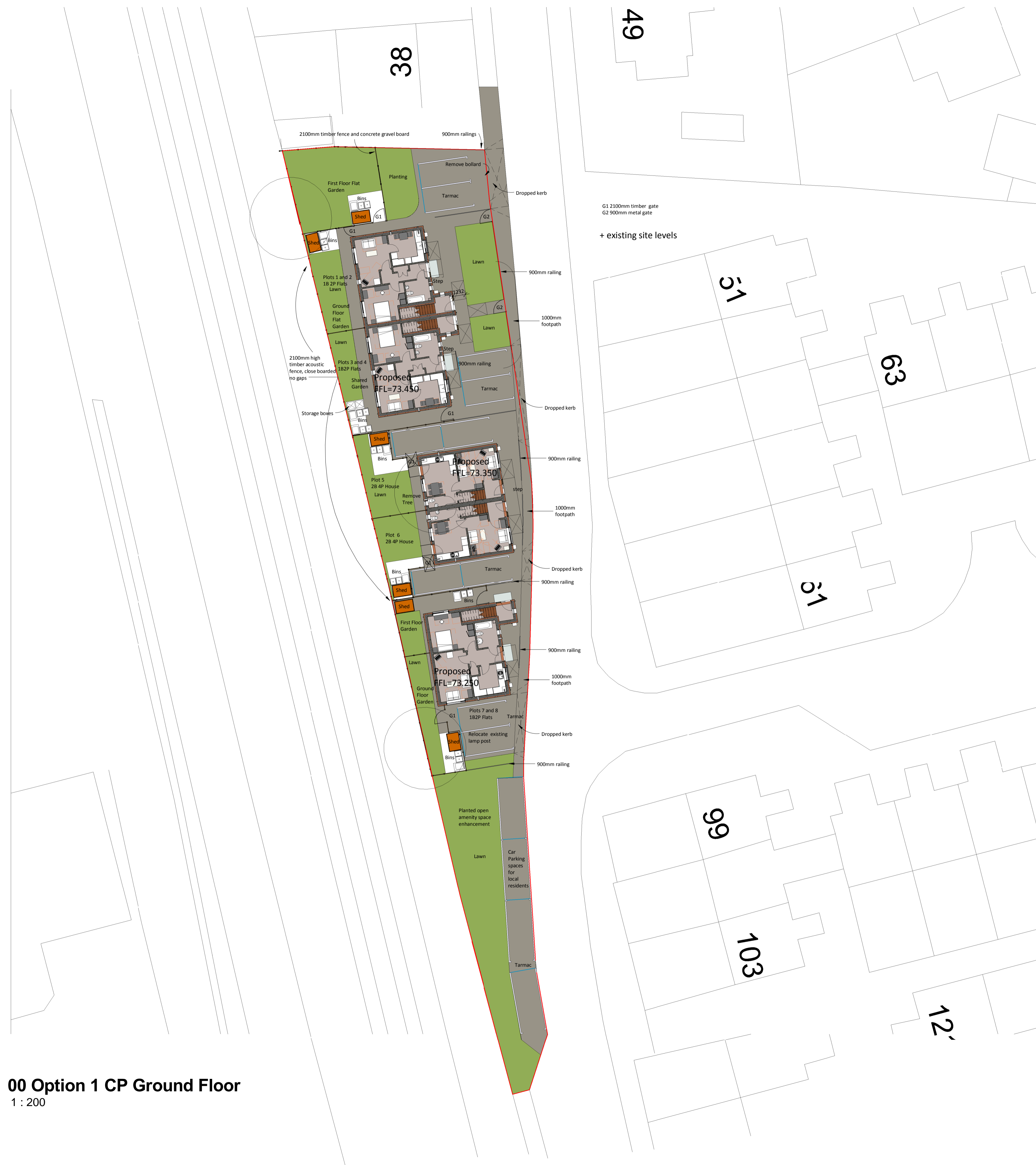
00 Option 1 CP Ground Floor 1 : 200